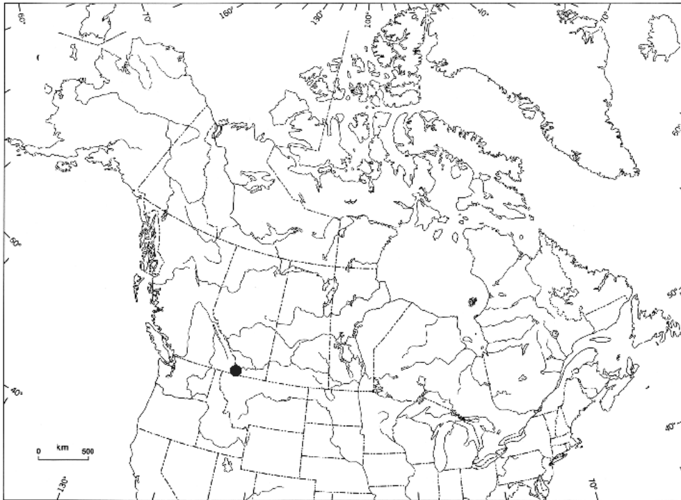
Figure 3. Canadian location of Isoetes bolanderi .

The Carthage Lakes area was searched unsuccessfully for I. bolanderi in 1995, 1996, 2002 and 2003 by Peter Achuff. The unusually high elevation of the Carthage Lakes site and absence of any subsequent I. bolanderi reports from there raised questions as to the legitimacy of the original 1946 discovery. An examination of Canadian Museum of Nature archives determined, however, that the collectors were indeed at that site on that day (Brunton 2002). The Carthage Lakes population is now considered extirpated since recent, thorough searches have failed to find it. The cause of the extirpation is not apparent but can be regarded as a stochastic event that befell a small population even though in a strict protected area.