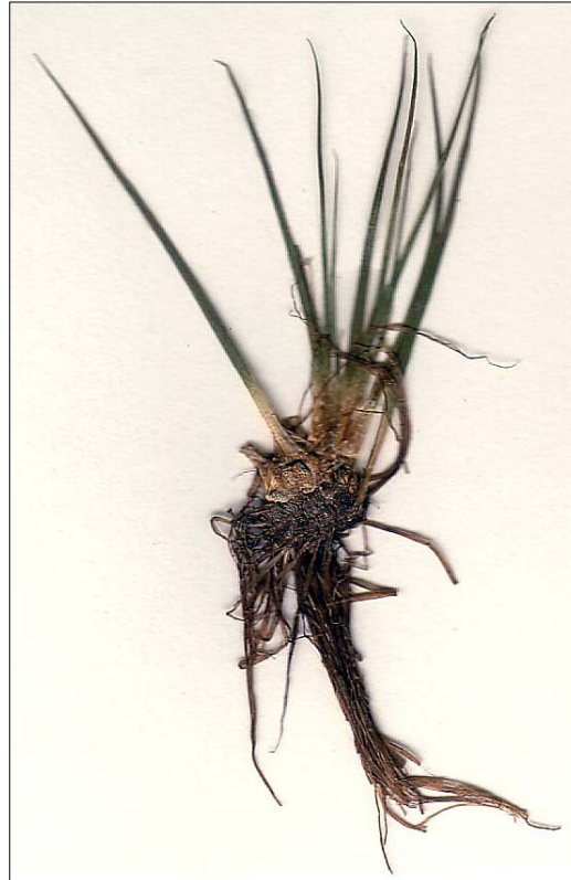
Figure 1. Single plant of Isoetes bolanderi , X1 (Collection #10,841 by D. F. Brunton, Park County, Wyoming, August 1991).

inundated sloughs and along emergent lake and river shores in sites with geologically younger, more complex substrates (e.g. the metamorphic bedrock of the Columbia Highlands of the Shuswap Lake area of interior British Columbia). Isoetes howellii typically has longer, more narrow, recurved to reflexed leaves that vary from dark green to grayish green and which do not readily separate from the corm, as with I. bolanderi .