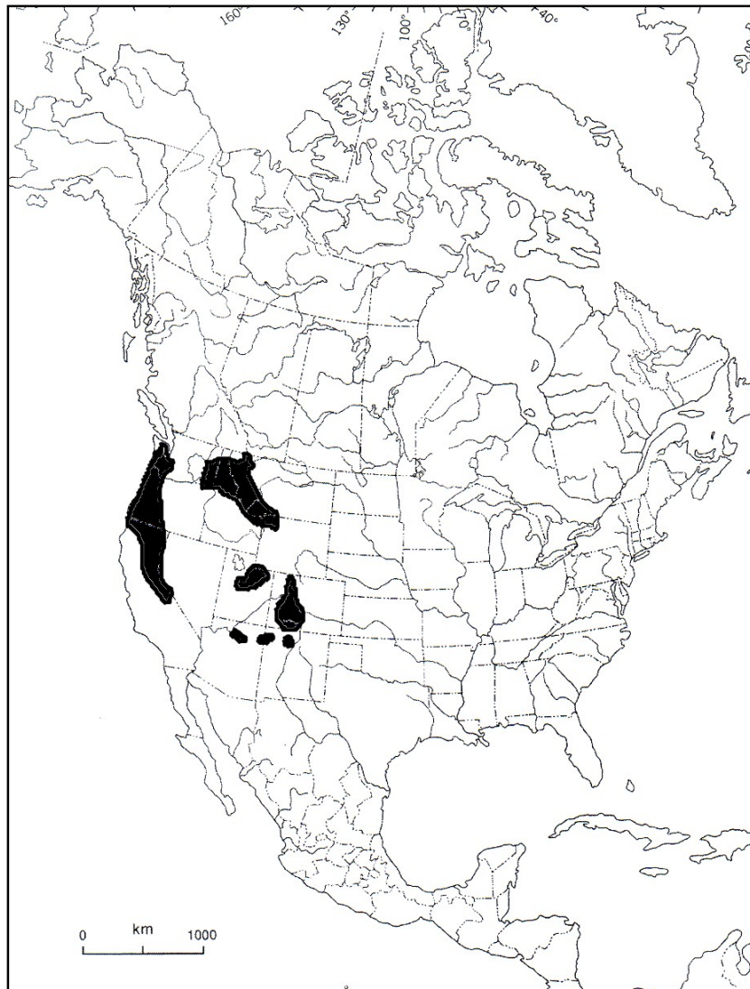
Figure 2. Global range of Isoetes bolanderi .