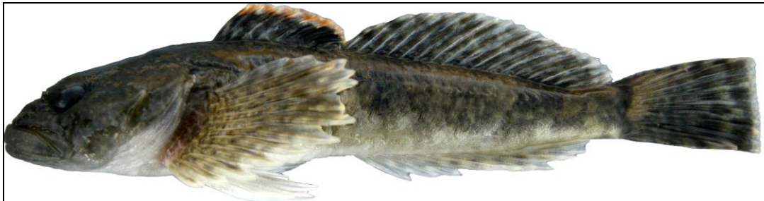
Figure 2. Rocky Mountain Sculpin

The Rocky Mountain Sculpin (Eastslope populations) is a small, bottom dwelling freshwater fish belonging to the predominantly marine sculpin family (Cottidae) and is characterized by a large head and heavy body that tapers towards the tail (Figure 2). These fish are endemic to North America and Canadian populations are generally restricted to reaches of British Columbia's Flathead River and its tributaries, which is part of the Columbia River system (Westslope populations), as well as to the St. Mary River system upstream of the St. Mary Reservoir and the North Milk and Milk rivers in southern Alberta Figure 1. Its taxonomic relationship to other sculpin species is uncertain (Young et al. 2013).