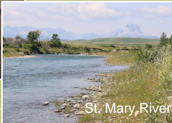
St. Mary River