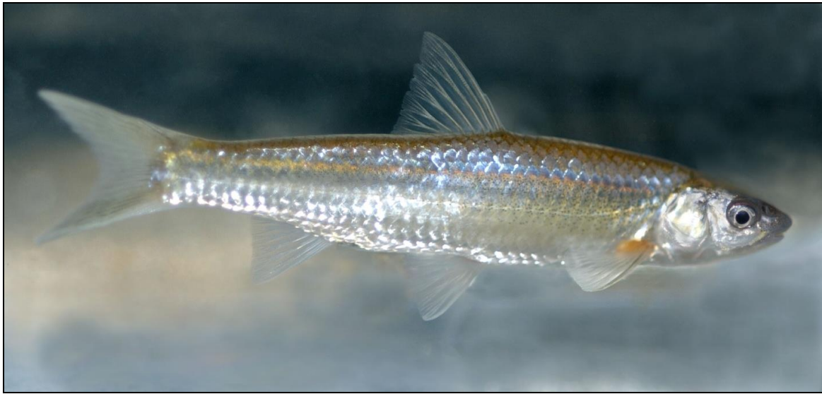
Figure 3. Western Silvery Minnow

The Western Silvery Minnow is a small cyprinid species native to Great Plains streams in North America. It has a head characterized by a blunt snout with a subterminal mouth and relatively large eyes (Scott and Crossman 1973) (Figure 3). The presence of the Western Silvery Minnow in Canada was first documented in 1961, in the lower Milk River, Alberta (Figure 1); it has not been verified in any other Canadian river systems since (ASRD 2003). Specimens in Alberta tend to be brownish-yellow on the back with silvery sides (Nelson and Paetz 1992).