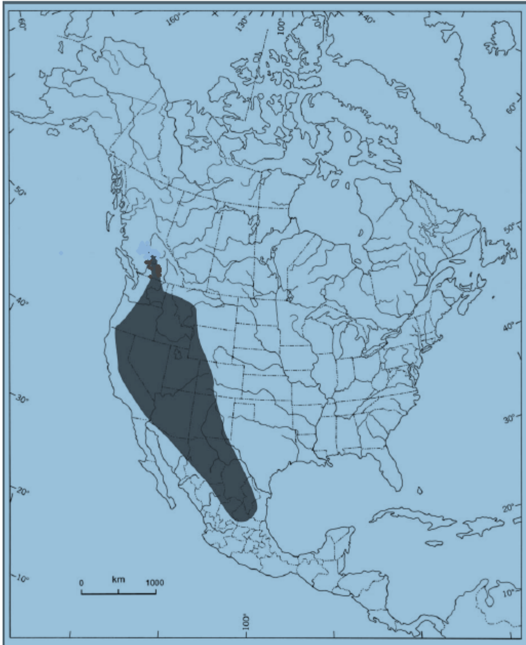
Figure 1. Spotted Bat distribution in North America (modified from COSEWIC 2004).